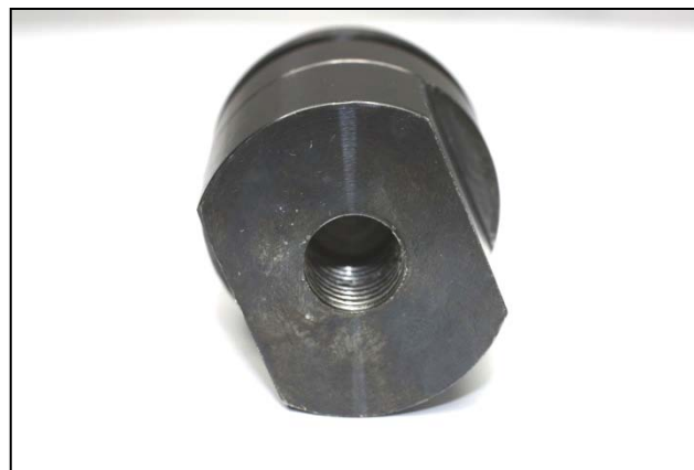
Figure 7a - Internal View of Figure 7

Figure 8 shows a counterfeit injector with the solenoid removed. The injector hold down clamp is also visible. This clamp on the counterfeit injector is made of aluminum as opposed to the steel clamp that is found on genuine injectors.