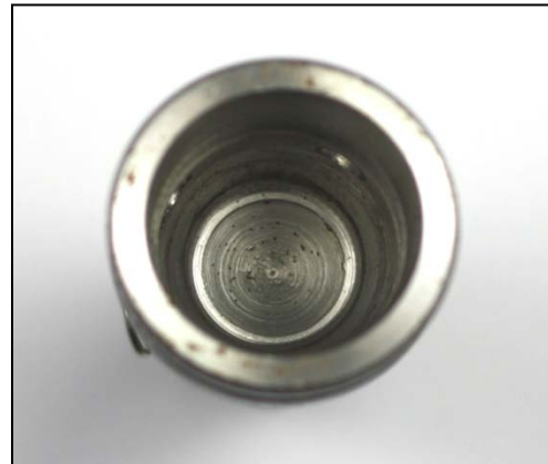
Figure 6a - Internal View of Figure 6